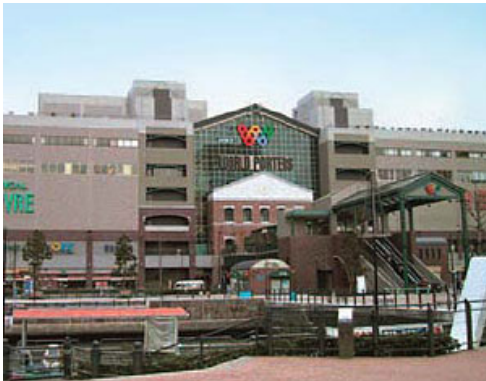
(Yokohama World Porters)

We offer “Rental Offices” exclusively to foreign affiliated firms until they set up their permanent offices or business bases in Yokohama.